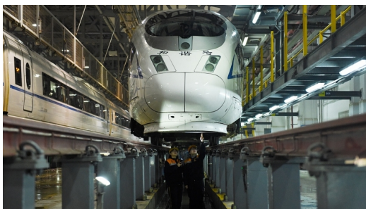
Female technicians of high-speed train 'black box'