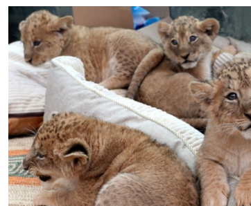
African lion quintuplets make debut in Kunming