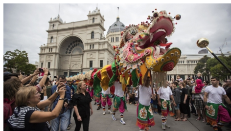
Lunar New Year a reminder of contribution of Chinese to Australia