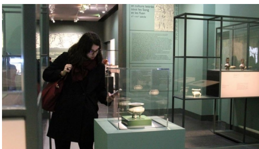
'Perfumes of China' exhibition opens in Paris' Cernuschi Museum