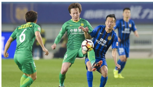
Guoan, Jianye snatch first victories in 2018 CSL