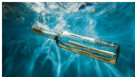
Oldest message in a bottle found at Australian beach