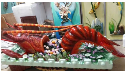
Life-like Styrofoam sculptures on display in Wuhan