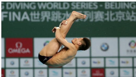
China finishes FINA Diving World Series Beijing with 3 more golds