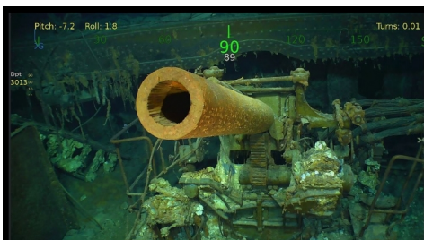
WWII aircraft carrier USS Lexington found off the coast of Australia