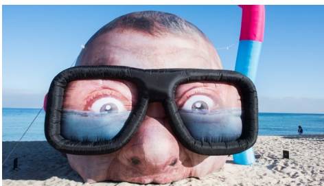
China's 'Floating Rock' shines at seaside sculpture festival in Australia