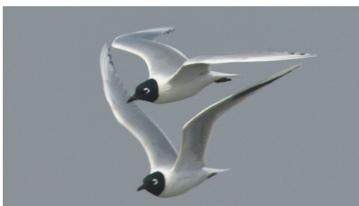
300 endangered Saunders's Gulls spotted in Qingdao