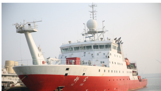
Chinese research vessel sets sail on seamount expedition