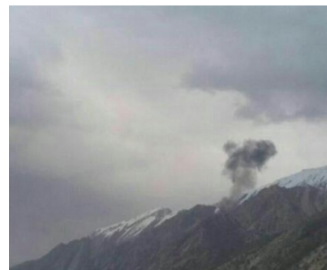
All 11 dead on board Turkish plane crashed in Iran