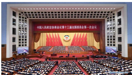
Revision of charter: Chinese political advisors push for democracy,