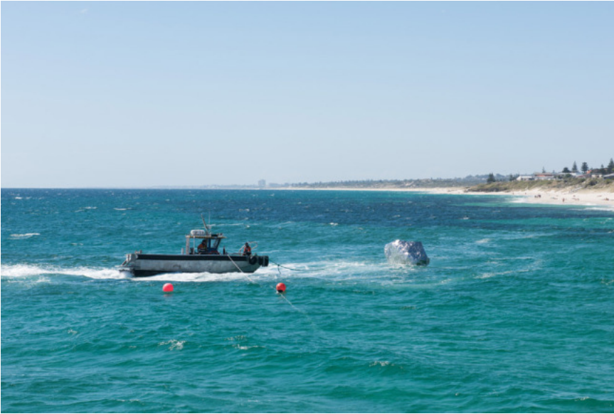
A stainless steel art work from China called "Floating Rock" is on display during the sculpture festival in Perth in Western Australia which lasts from March 2 to March 19.

His work was the first by a Chinese contemporary sculptor to be added to the collection of the Metropolitan Museum of Art in New York, one of the world's premier art institutions.