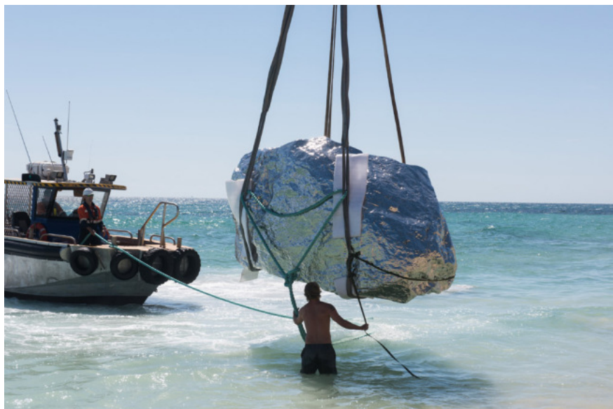
A stainless steel art work from China called "Floating Rock" is on display during the sculpture festival in Perth in Western Australia which lasts from March 2 to March 19.

Qi Zhi China Plus Published: 2018-03-12 09:56:15