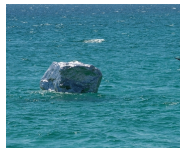
'Floating Rock' from China shines at seaside sculpture festival in