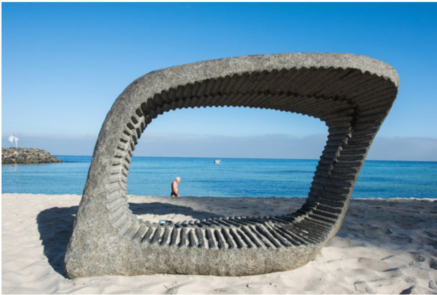
A stainless steel art work from China called "Floating Rock" is on display during the sculpture festival in Perth in Western Australia which lasts from March 2 to March 19.

"Floating Rock" is one of more than 70 sculptures installed at the beach. They include two other works by Chinese artists.