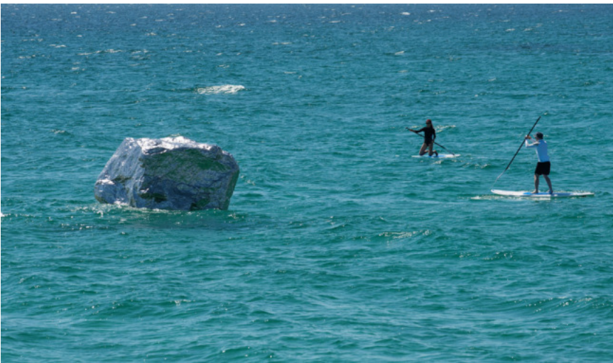
A stainless steel art work from China called "Floating Rock" is on display during the sculpture festival in Perth in Western Australia which lasts from March 2 to March 19.

The "Floating Rock" is the latest addition to Zhan Wang's well-known "Artificial Rocks" series. Zhan started the series back in 1995 to express a feeling of change, freedom, and the unknown in a rich and chaotic world.