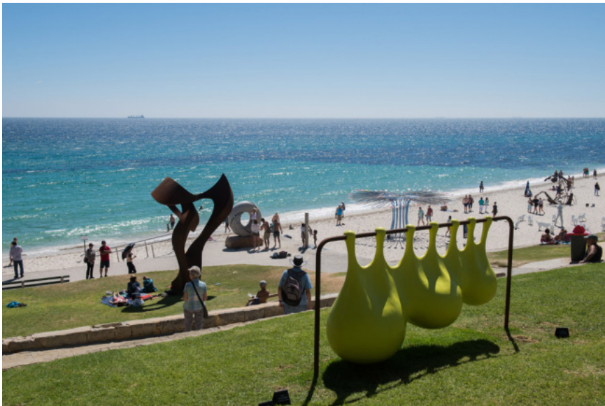
Artworks are on display during the sculpture festival in Perth in Western Australia which lasts from March 2 to March 19.

"I think they are quite unique and different to Australian artists. Australian artists, I think, are very raw, whereas Chinese art are very polished. It's definitely particular to your culture. The 'Floating Rock' is crazy! How does someone think of that idea!" said an Australian woman.